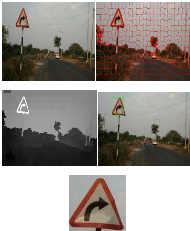
Fig.3.1 First row images, Input image (left) and segmented image (right). Second row, saliency image (left) and Region of Interest (right). Last row represents the salient object being isolated.