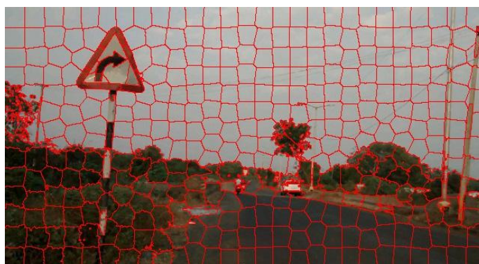
Fig.2.2 The output of image segmentation algorithm

In computer vision, image segmentation is the process of partitioning a digital image into multiple segments. More precisely, image segmentation is the process of assigning a label to every pixel in an image such that pixels with the same label share certain characteristics. In graph based algorithms, each pixel is treated as a node in a graph, and edge weight between two nodes are set proportional to the similarity between the pixels. Superpixel segments are extracted by effectively minimizing a cost function defined on the graph. Fig.2.2 shows the segmented image. The Graph based algorithm performs an agglomerative clustering of pixel nodes on a graph, such that each segment, or superpixel, is the shortest spanning tree of the constituent pixels.