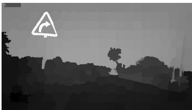
Fig.2.3 Saliency of an input image

The Fig.2.3 shows the saliency image. Further the output we can observe that only the sign board is highlighted which is the region of interest in sign board detection.