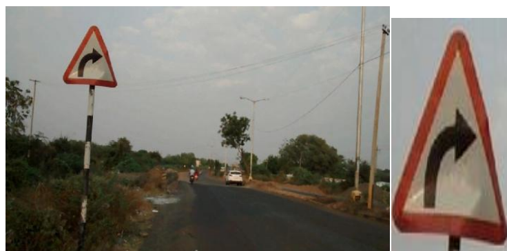
Fig.1.1 Input image for sign board detection (left) which consist of redundant region. Image which consist of only sign board which the region of interest (Right)

In today's growing technology accuracy and speed are the two most vital parameter. When it comes to real time application execution time is important. The driverless car, that is Autonomous car has to make the thousands of decision within fraction of second. In image processing, to identify an object the entire image has to be scanned and processed which is time consuming. Saliency map can be used in such cases where execution time is most important. Saliency map is an intermediate stage which helps to reduce the region of interest neglecting the redundant region. Fig.1.1 shows the example of sign board detection where sign board the region of interest and the remaining region is redundant which can be neglected.